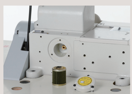
The oil filter catches dirt and dust, keeping the oil clean.